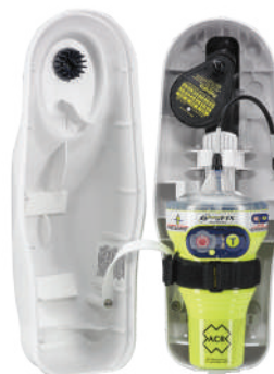
Category I Bracket (Auto Release)