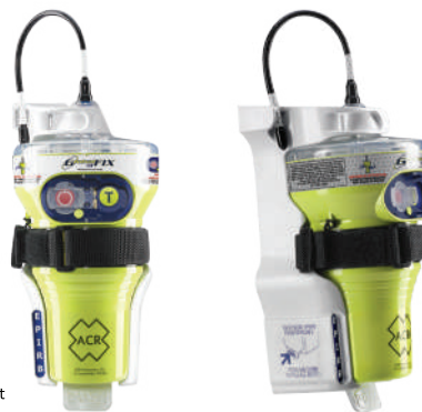
Category II Bracket (Manual Release)