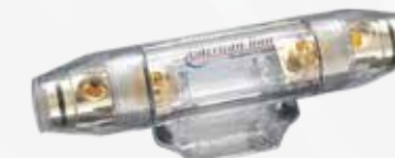
AB WP ANL 10