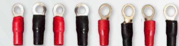
AB RT04 | AB RT08