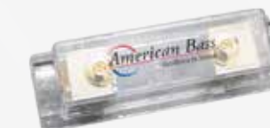
AB ANL FH