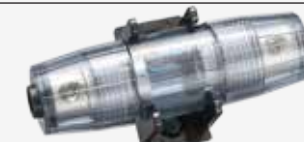
AB AGU FH