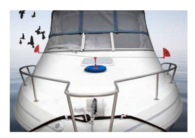
Ideal for use on boats!

Bird•B•Gone® Repeller 360°™ is pre-assembled, easy to install, and can be used in a variety of settings including: boats, docks, biminis, light posts, air conditioner units, skylights, dock pilings, and more! The patented Bird•B•Gone® Repeller 360°™ bird deterrent features stainless steel arms attached to a UV protected polycarbonate base. Optional bases are available to secure the Repeller 360°™ (sold separately).