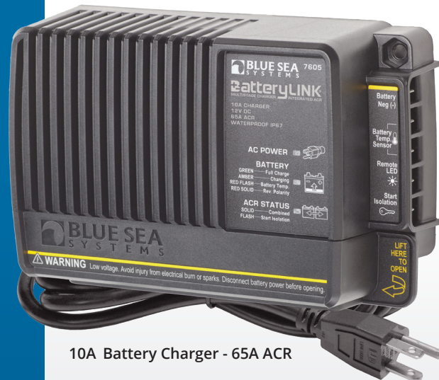
10A Battery Charger - 65A ACR