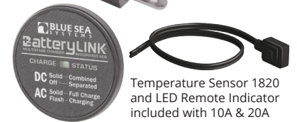
Temperature Sensor 1820 and LED Remote Indicator included with 10A & 20A BatteryLink Chargers