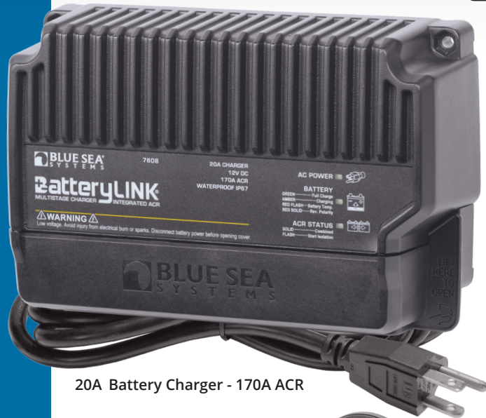
20A Battery Charger - 170A ACR