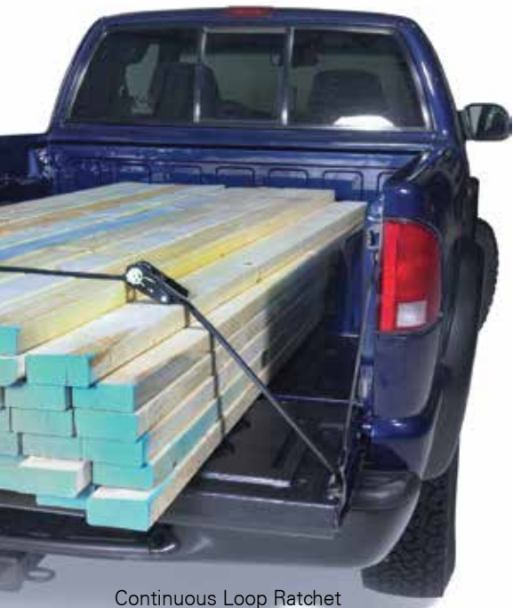
Continuous Loop Ratchet

1.0 in. x 15 ft. Break Strength 1,000 lbs. SWL 333 lbs. Clam single item Case Quantity 6