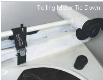
Trolling Motor Tie-Down

Length 12 in./6 in. Clam Set Case Quantity 12