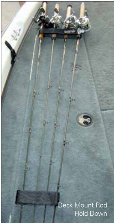
Deck Mount Rod Hold-Down

The Vertical Rod Hold-Down features two foam molded rod inserts that hold up to 8 rods. Innovative design conceals all mounting hardware.