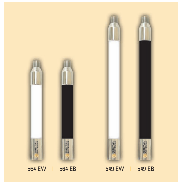
564-EW | 564-EB | 549-EW | 549-EB