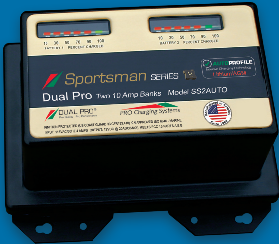
Sportsman Series with AutoProfile (with 1, 2, 3, or 4) 10 Amp banks