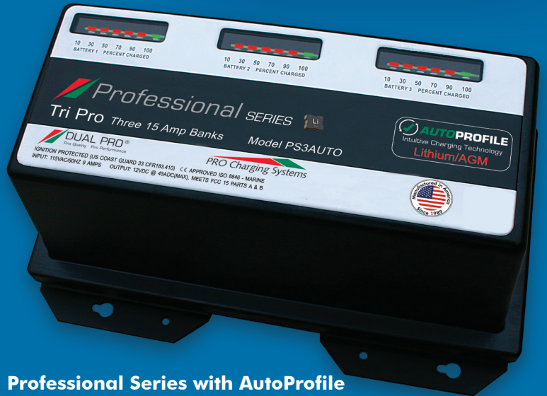
Professional Series with AutoProfile (with 1, 2, 3 or 4) 15 Amp banks