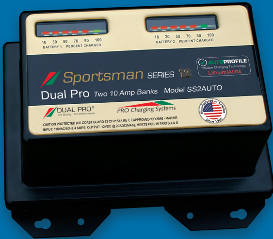
Sportsman Series with AutoProfile (with 1, 2, 3, or 4) 10 Amp banks