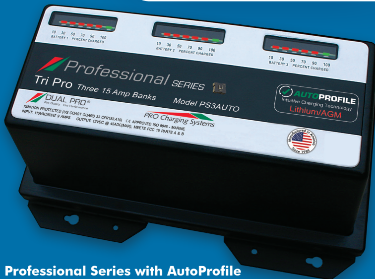
Professional Series with AutoProfile (with 1, 2, 3 or 4) 15 Amp banks