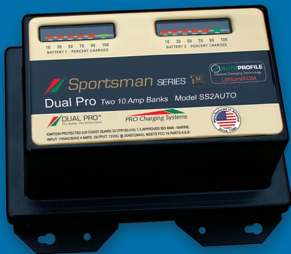
Sportsman Series with AutoProfile (with 1, 2, 3, or 4) 10 Amp banks