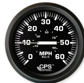
Scale may vary depending on model.

Speed data is shown by an analog pointer. This pointer is driven by a digital stepper motor for increased accuracy and minimized pointer bounce during vessel operation.