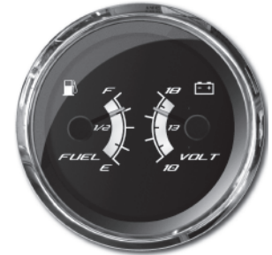
Scale may vary depending on model.

Let us be your solution for dash overload.