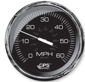
Scale may vary depending on model.

Speed data is shown by an analog pointer. This pointer is driven by a digital stepper motor for increased accuracy and minimized pointer bounce during vessel operation.