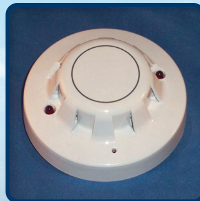
Photo Electric Smoke Detector Model AP65-PESD-02-TB