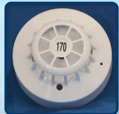
Heat Detector 170F Model AP65-HD170-02-TB