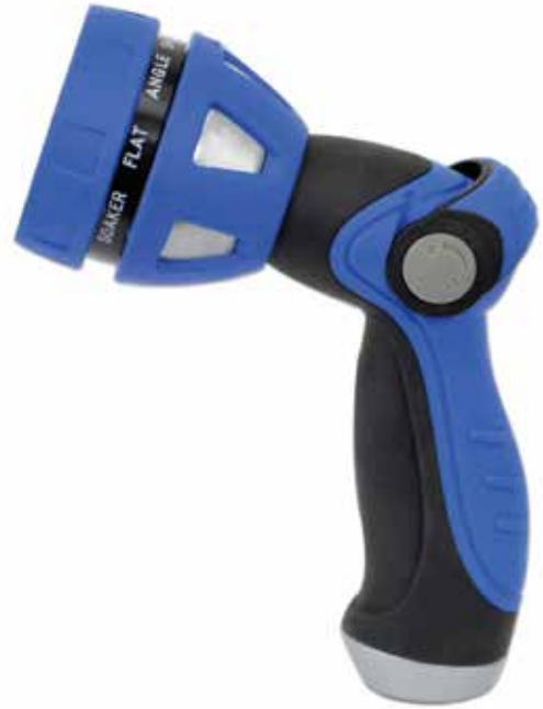
Thumb Lever Nozzle with Metal Body & Nine Pattern Adjustable Spray Head Part # WN815