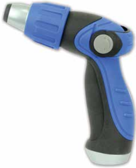
Thumb Lever Nozzle with Metal Body & Adjustable Tip Part # WN810