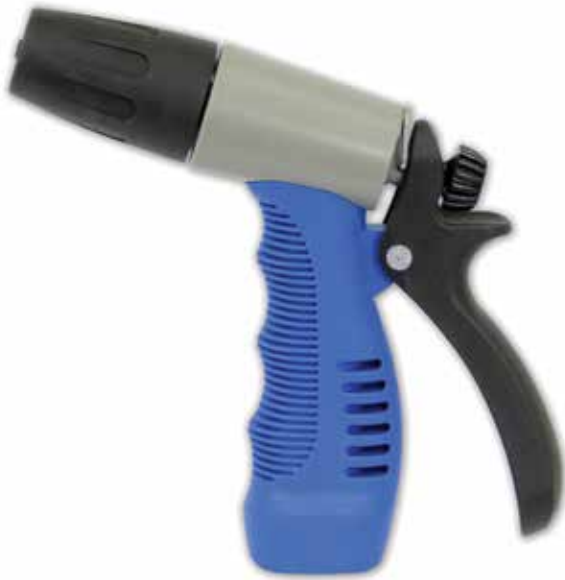
Rubber Tip Nozzle with Comfort Grip Part # WN510