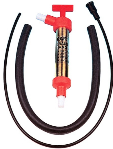
34060-0010 'LITTLE PAL'

JABSCO hand pumps pump more liquid with less effort! They never need coaxing or priming and give full suction on the first stroke. Pumps can be used in any position.