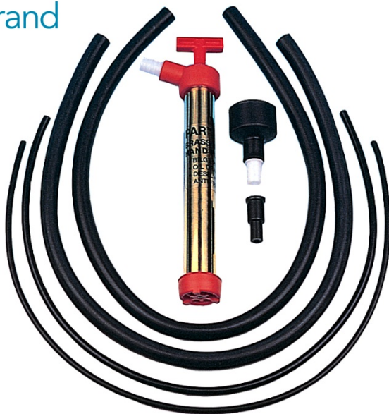
33799-0000 'HANDY BOY'