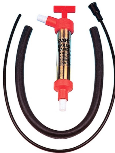
34060-0010 'LITTLE PAL'

JABSCO hand pumps pump more liquid with less effort! They never need coaxing or priming and give full suction on the first stroke. Pumps can be used in any position.