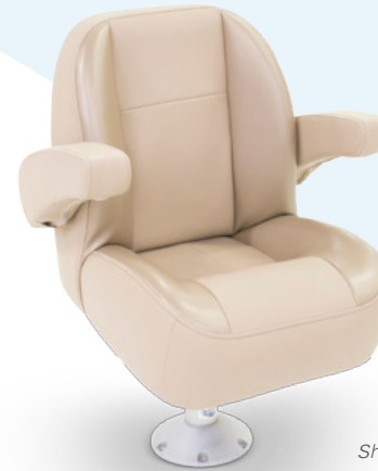
Shown in beige