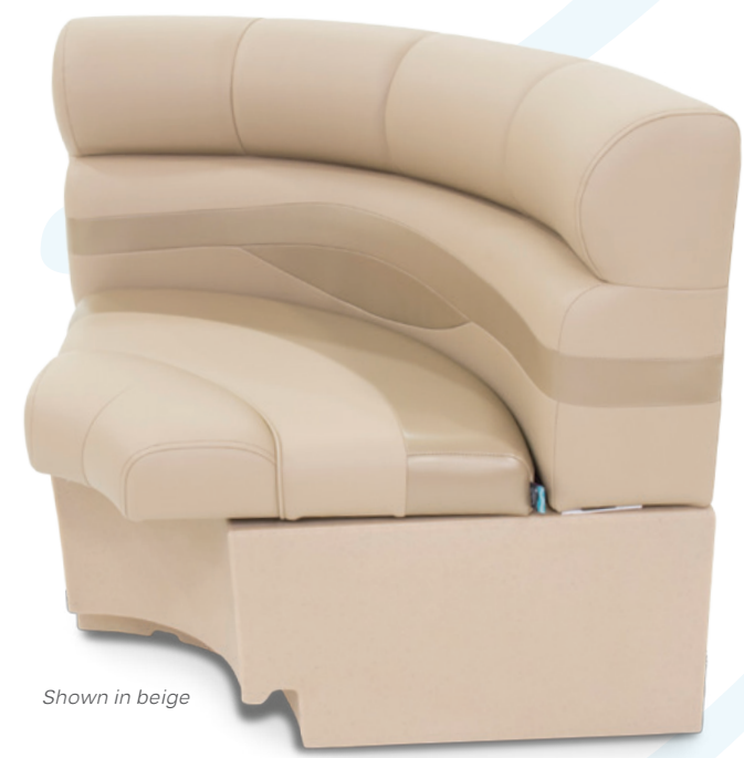
Shown in beige