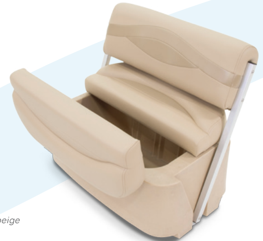
Shown in beige