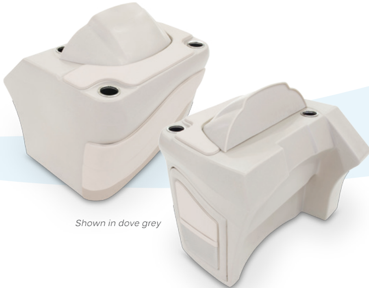
Shown in dove grey