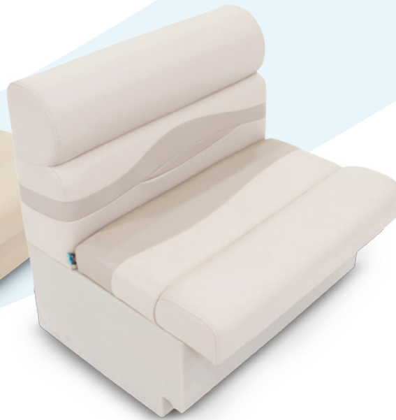
Shown in dove grey