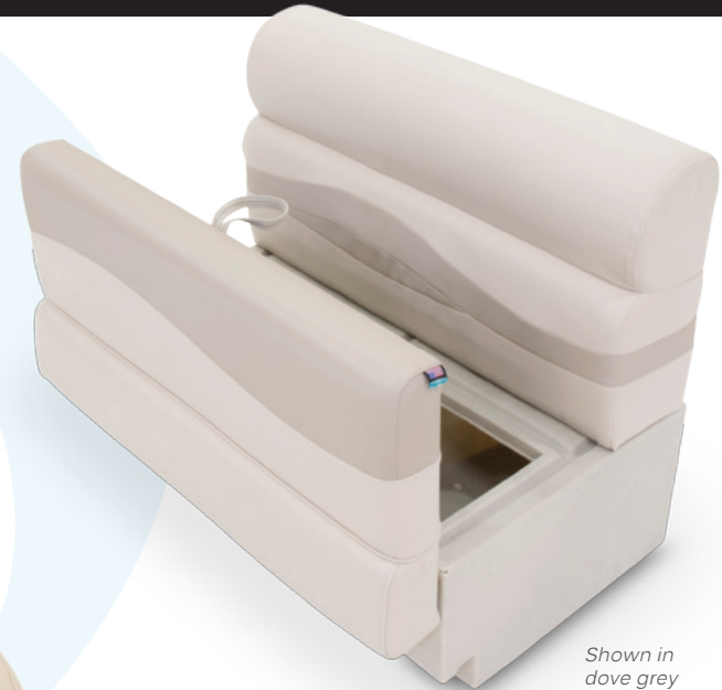
Shown in dove grey