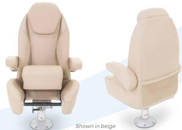
Shown in beige

Our line of high and low back recliner seats provide unparalleled comfort and durability. Featuring a stylish and modern appearance, our helm seating is constructed to withstand extreme climate conditions and resist wear from long-term and frequent use.