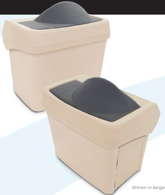
Shown in beige