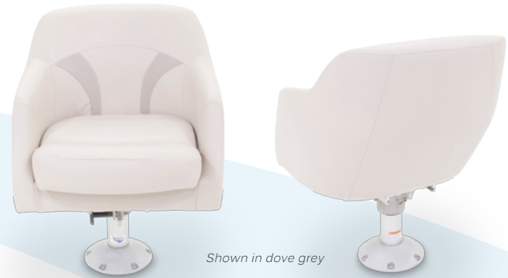
Shown in dove grey

Touting a sporty appearance, our bucket seating offers the driver flexibility and comfort.