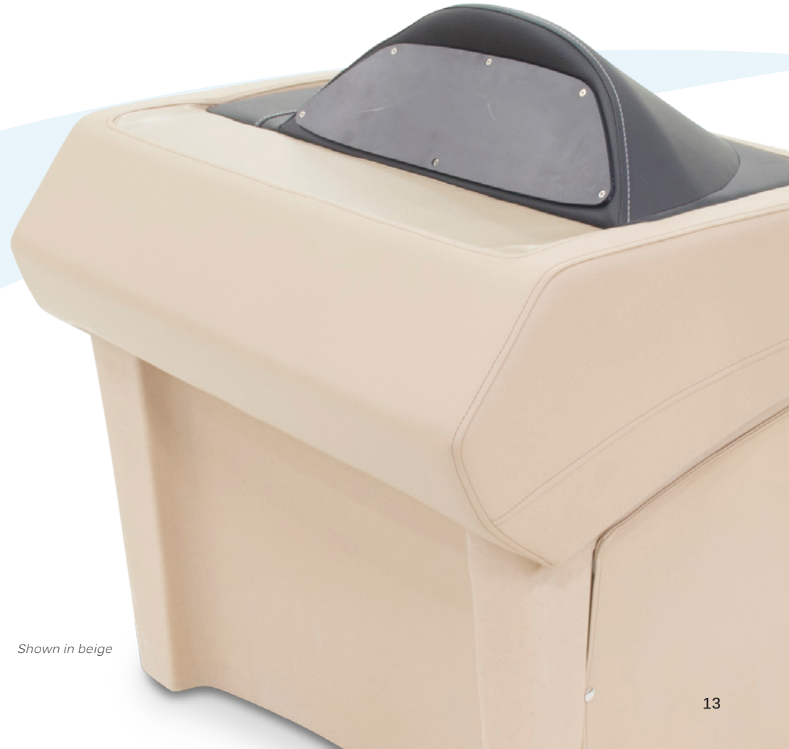
Shown in beige