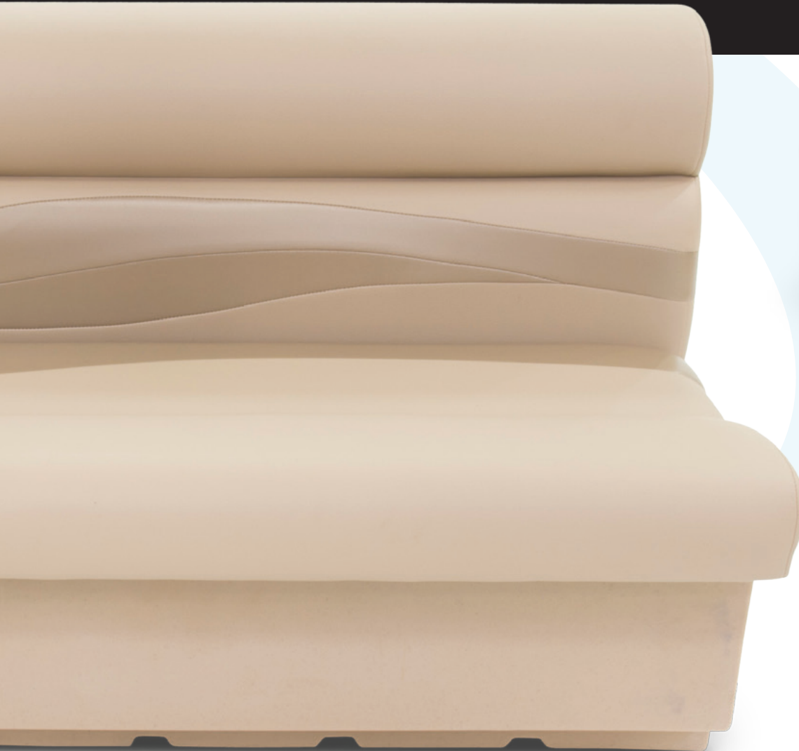
Shown in beige