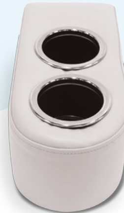
Shown in dove grey

Our customizable cupholders are designed for functionality while minimizing onboard space usage and providing configuration versatility. Cooling options available.