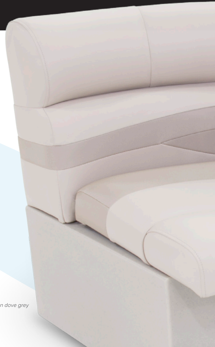
Shown in dove grey