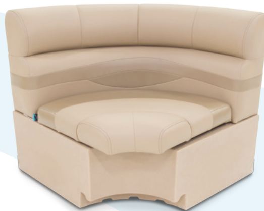
Shown in beige

Designed to seamlessly integrate with all lines of pontoon seating available in the marine market, our corner seats offer a simple and effective replacement option.