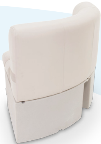
Shown in dove grey