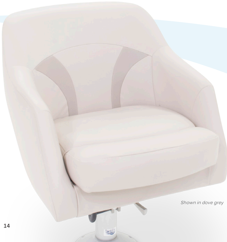
Shown in dove grey