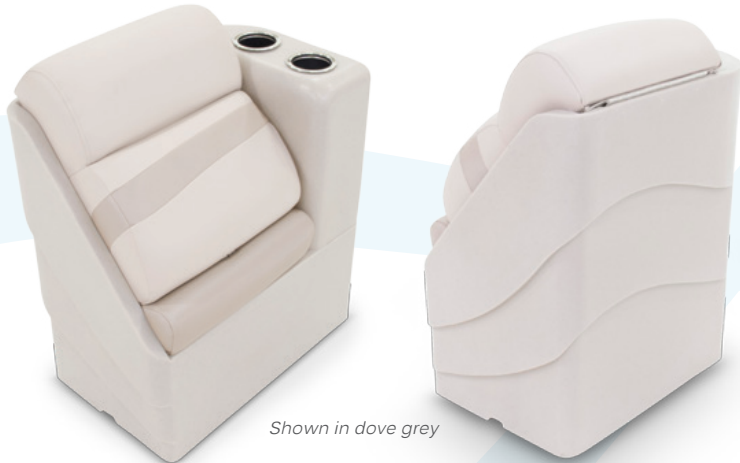
Shown in dove grey

Boasting a variety of uses from additional storage space to optional privacy areas for changing.