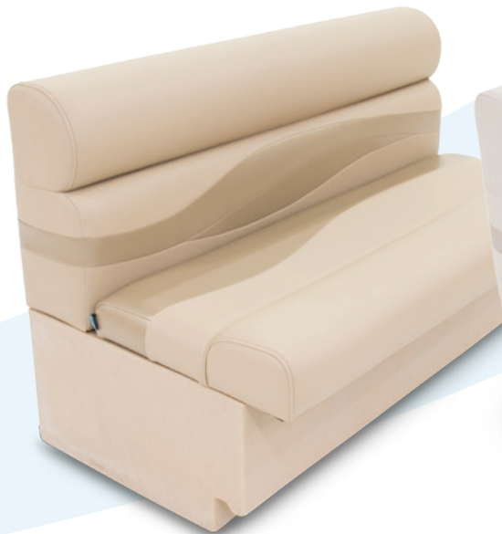
Shown in beige

Relax and unwind on the bench seating that sets the industry standard. Our rotationally-molded bench seating frames and bases allow for the most seating support and storage capacity within the marine and pontoon furniture industry.