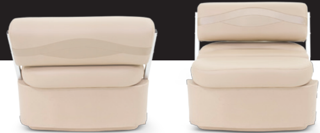
Shown in beige

The flip flop seat allows for seating in any desired direction and its interior compartment provides additional dry storage onboard.