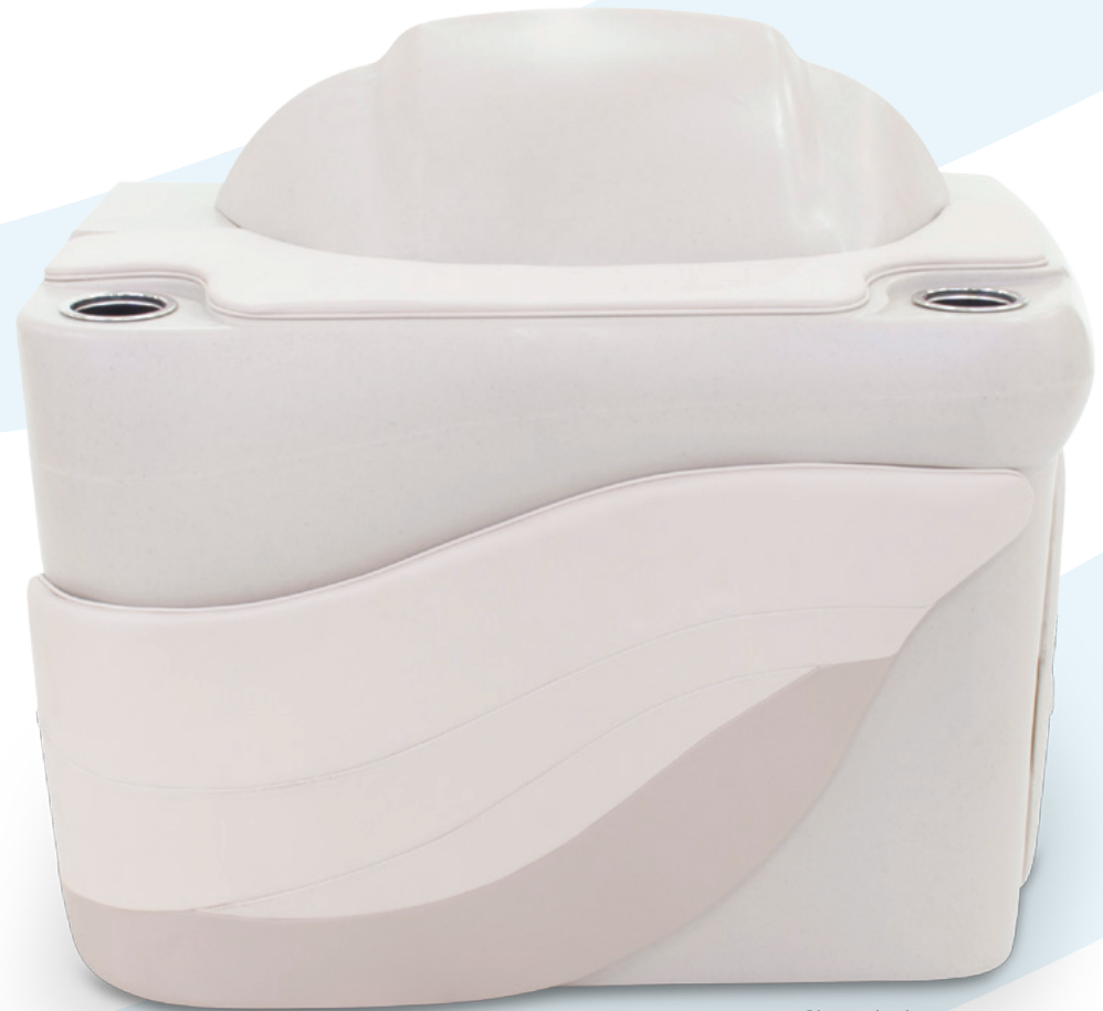
Shown in dove grey

Featuring rotationally-molded polyethylene construction and designed to resist warping with strong wall thicknesses, our helm stations are not only contemporary and attractive, but functional and easy to install.