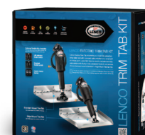
Retail Box See check-list below