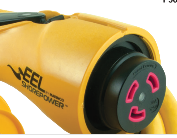
50A 125/250V Locking