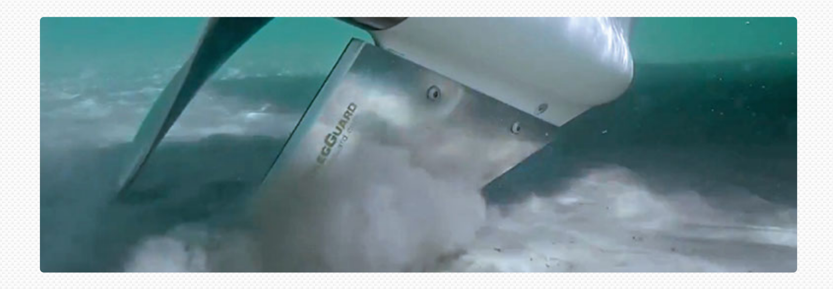
Rely on premium boat parts & hardware by Megaware if you're looking for quality and efficiency.

Megaware SkegGuard® is available in models to fit virtually any skeg.