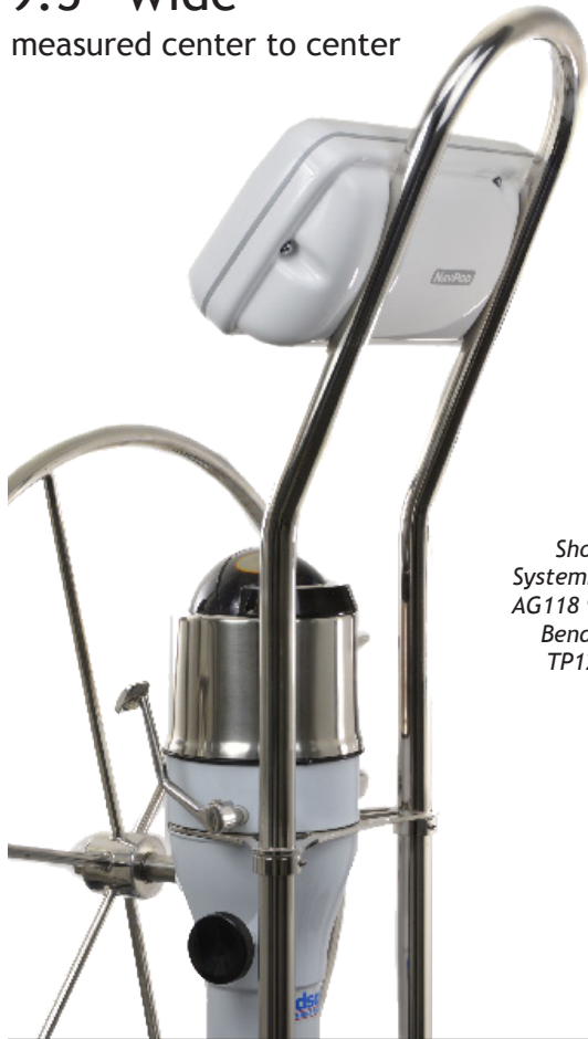
Shown: GP1500 SystemPod mounted on AG118 9.5" wide Single Bend AngleGuard. TP125 Top Plate.