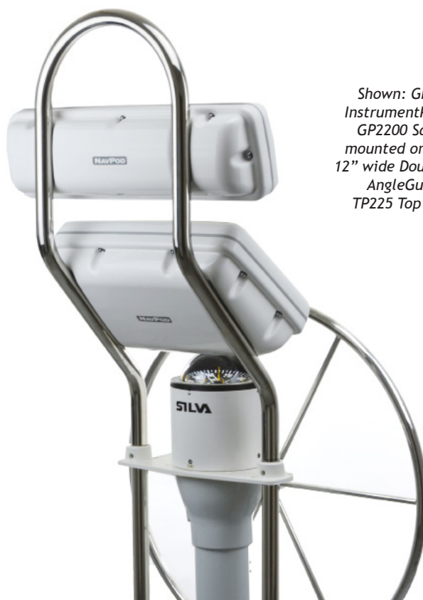
Shown: GP2400 InstrumentPod and GP2200 SailPod mounted on AG227 12" wide Double Bend AngleGuard. TP225 Top Plate.