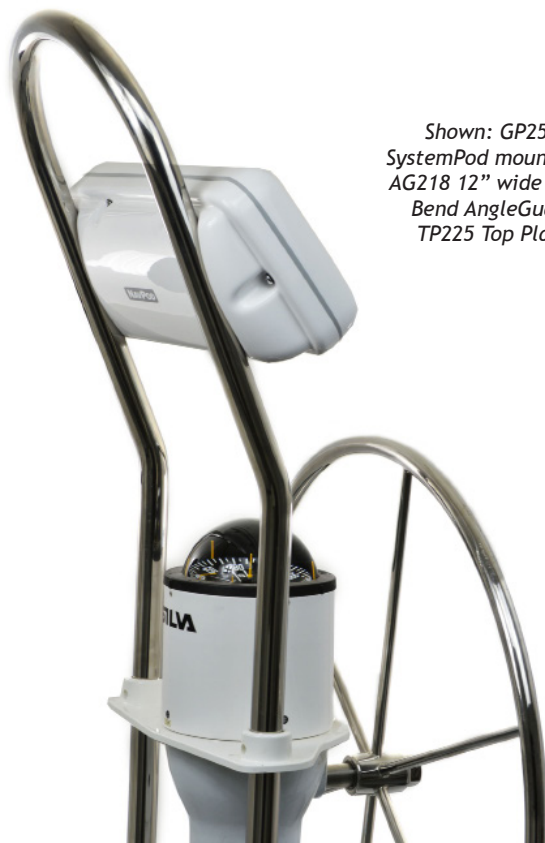
Shown: GP2500 SystemPod mounted on AG218 12" wide Single Bend AngleGuard. TP225 Top Plate.