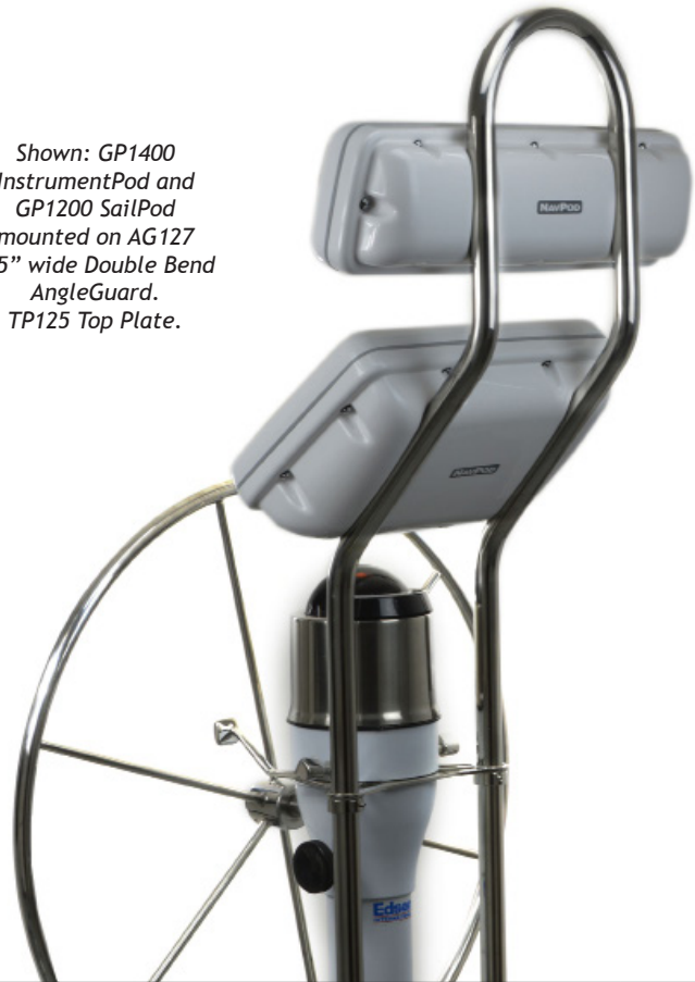
Shown: GP1400 InstrumentPod and GP1200 SailPod mounted on AG127 9.5" wide Double Bend AngleGuard. TP125 Top Plate.