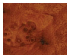
4 Woodtec Curl Elm