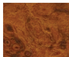
5 Woodtec Teak