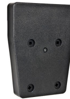
Poly board measures approx. 8" wide x 10" long Part number 99-55650

Always remove your motor from bracket when trailering. Failure to do so may result in damage to boat, motor or bracket.