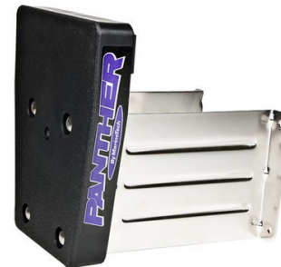
Bracket setback length including Poly board is 10.125"

Always remove your motor from bracket when trailering. Failure to do so may result in damage to boat, motor or bracket.