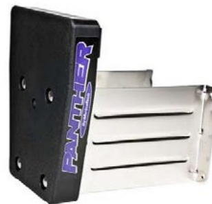
Bracket setback length including Poly board is 10.125"