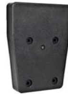
Poly board measures approx. 8" wide x 10" long Part number 99-55650

Always remove your motor from bracket when trailering. Failure to do so may result in damage to Boat, Motor or Bracket.