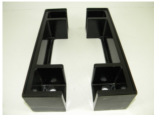
This side to motor