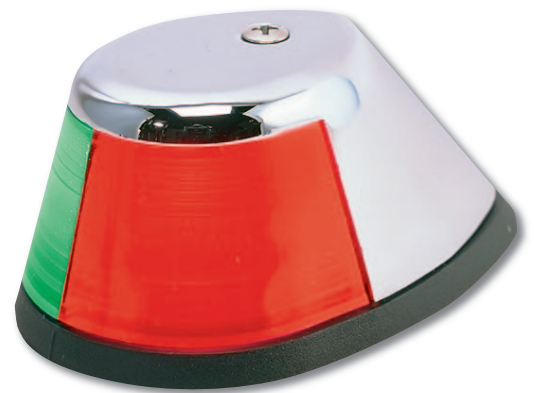
Fig. 0252 Chrome