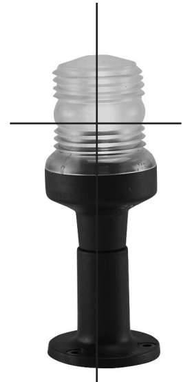
Fig. 0455 Series (Power Driven Vessels Only)

NOTE: GLOBES MUST BE VERTICAL DURING OPERATION