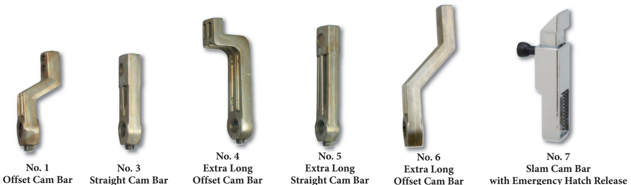
No. 1 Offset Cam Bar