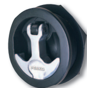
Fig. 1093 Pull

Consult factory for custom colors matches