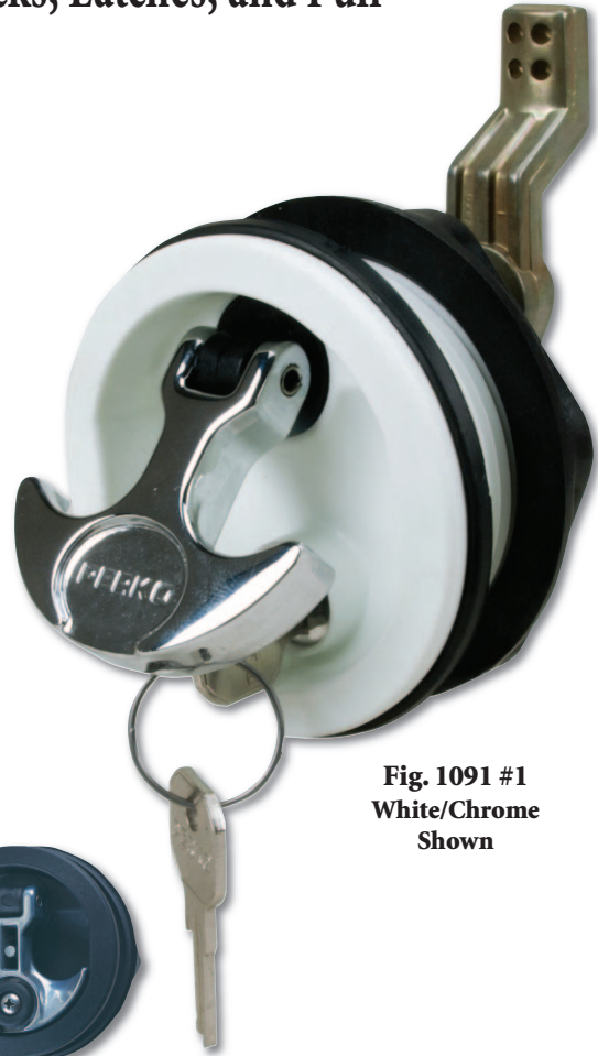
Fig. 1091 #1 White/Chrome Shown

The T - Handle Drops Down Flush in Either the Open or Closed (180° Rotation) Position (Except with the Offset Cam Bar Positioned Upward)