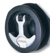
Fig. 1093 Pull

Consult factory for custom colors matches