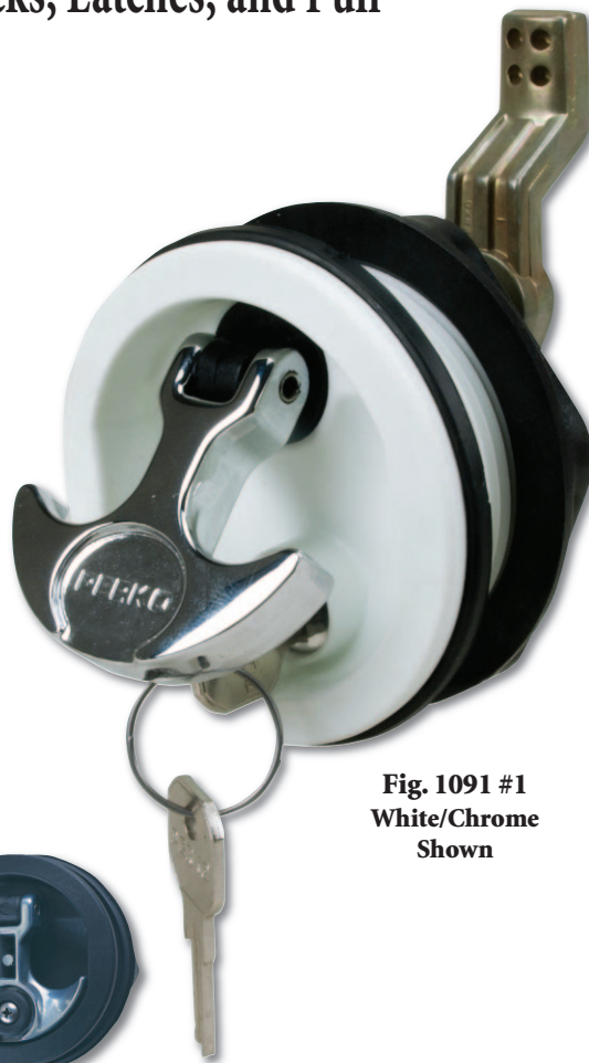
Fig. 1091 #1 White/Chrome Shown

The T - Handle Drops Down Flush in Either the Open or Closed (180° Rotation) Position (Except with the Offset Cam Bar Positioned Upward)