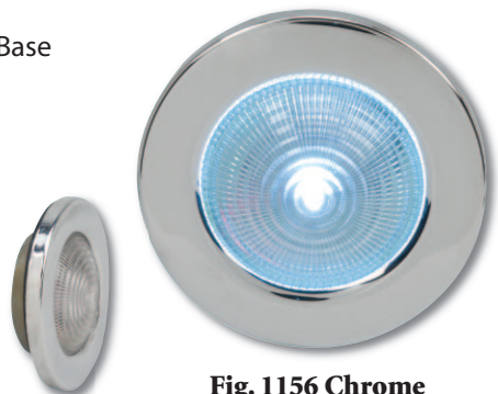
Fig. 1156 Chrome