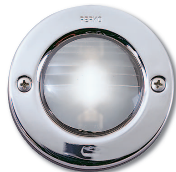
Fig. 1146 Chrome