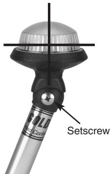
Note: Clear Globes Must Be Vertical During Operation.