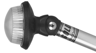
Delta Series The Ultimate Pole Light