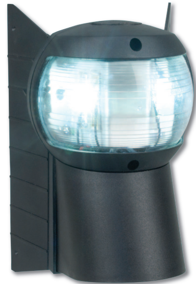
Fig. 0170BMD LED