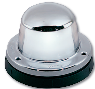
Fig. 0964 Masthead