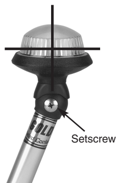
Note: Clear Globes Must Be Vertical During Operation.