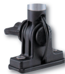
Fig. 1637 Vertical Mount