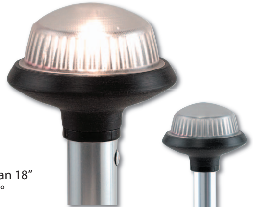
Fig. 1637 Vertical Mt. (Shown)