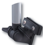
Fig. 1634 Horizontal Mount