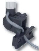
Fig. 1607 Tower/Arch Folding Mt.