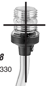
Globe 0248 Fig. 1311 & 1330