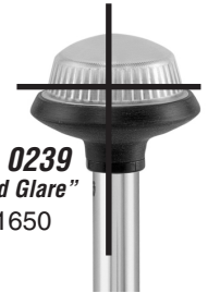
Globe 0239 "Reduced Glare" Fig. 1650

This is a 3/4" circle in order to scale internet printed templates