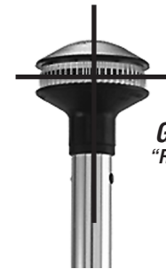
Globe 0238 "Reduced Glare" Fig. 1431 & 1632