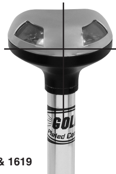
Figs. 1617 & 1619

NOTE: Top of light must be vertical during operation.