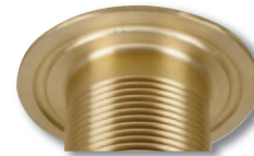
Illustration Of Bedding Groove

Spare Flanged Nut See Fig. 0075, on page 105.