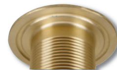
Illustration Of Bedding Groove

Spare Flanged Nut See Fig. 0075, on page 105.