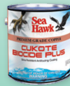
Cukote Biocide Plus