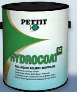
HYDROCOAT SR The Worlds Best Selling Dual-Biocide, Water Based Ablative