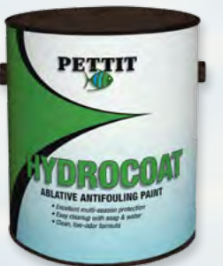
HYDROCOAT The Worlds Best Selling Multi-Season, Water Based Ablative