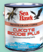
Cukote Biocide Plus