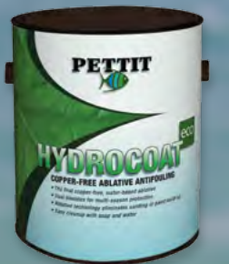
HYDROCOAT ECO The Worlds First Dual- Biocide, Copper-Free, Multi-Season, Water Based Ablative