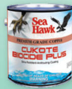
Cukote Biocide Plus