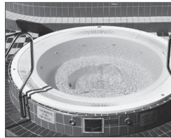
SPA WATER REMOVAL