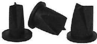
Check Valve Included