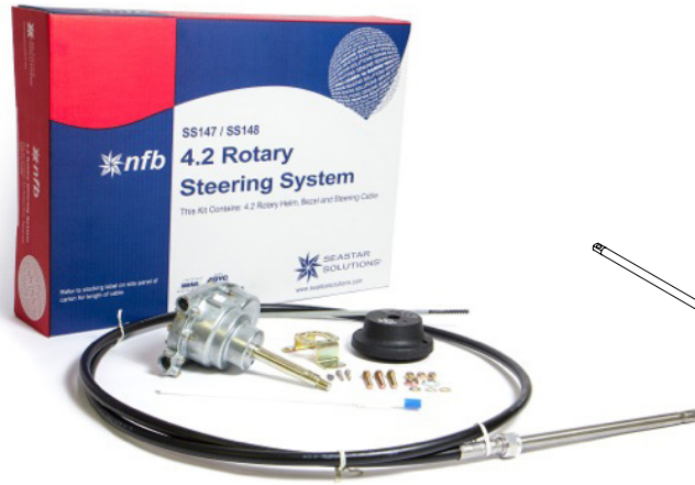
NFB™ 4.2 Single Cable System (Steering Wheel not included.)

Issue Date - Jan 2015 Issue Number - ms6