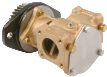
P1727A, P1727C, P1727X, P1730A, P1730C, P1730X, P1731, P1733X