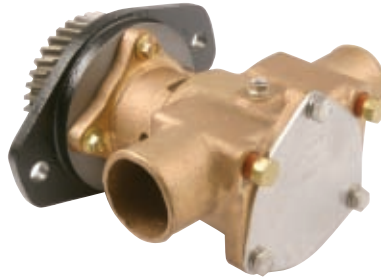
P1716A, P1716C, P1716X, P1722A, P1722C, P1722X, P173