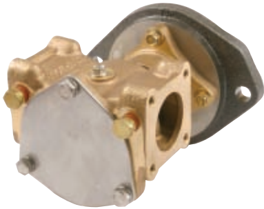
P1710A, P1710C, P1710X, P1726X, P1732A, P1732C, P1732X