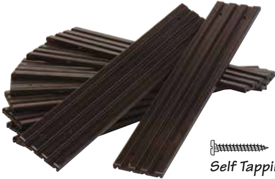
Self Tapping Screws

Part 86164 - Kit contains the following components: