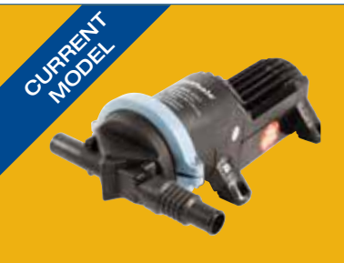
AK2050 Pump head assembly