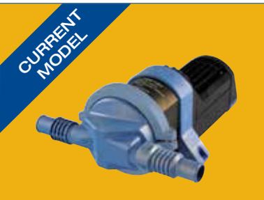
AK2050 Pump head assembly