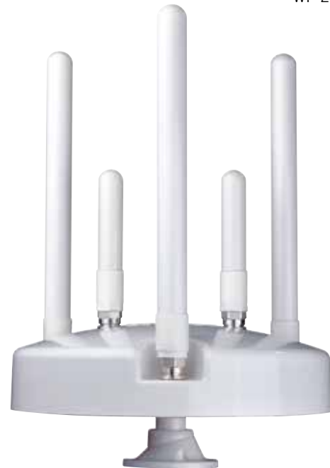
Winegard Connect 4G1xM WF-200M

Winegard Connect data plan required for 4G LTE service.