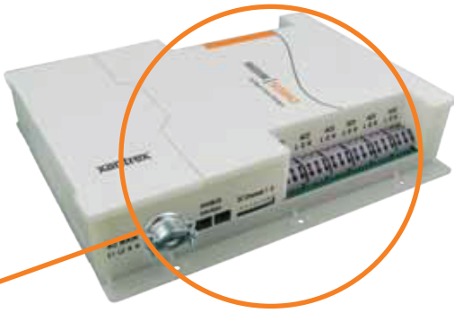
Freedom Sequence Intelligent Power Manager